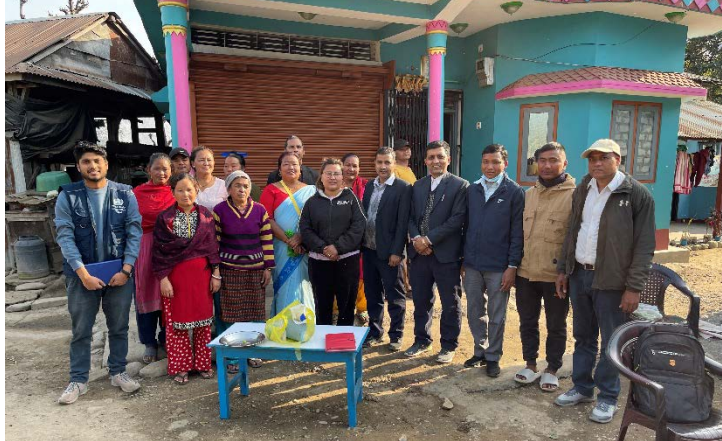
conducted active case detection at Dharesimal, ward no 11 Madhyabindu Municipality, Nawalparsi East.