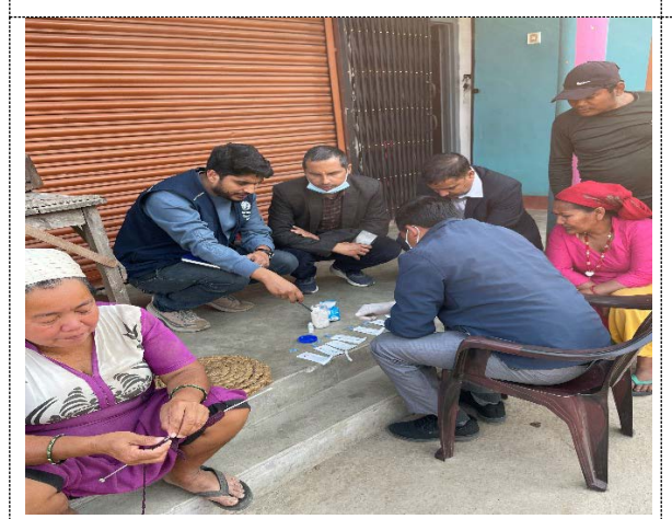
Screened Kala-Azar test at Madhyabindu Municipality, Nawalparsi East, Gandaki.