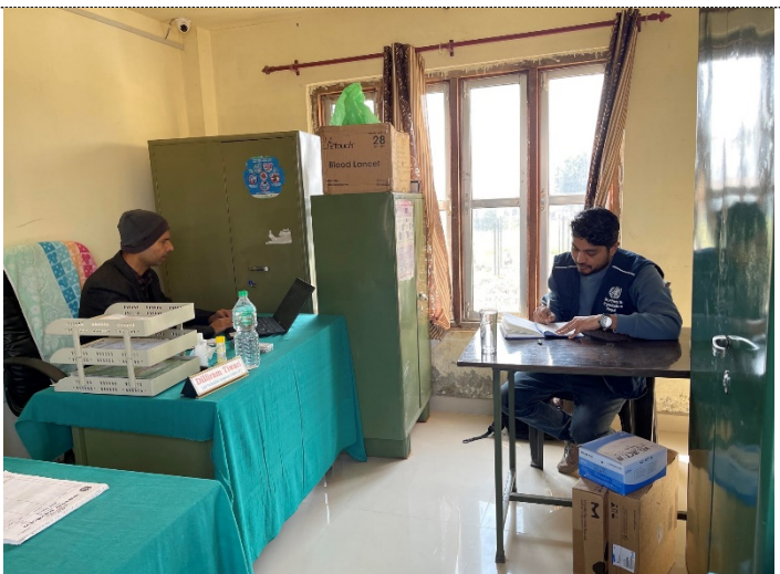
Preparedness of IRS activity including trained personnel, IRS Pumps, Insecticides at Health Office, Nawalparsi East