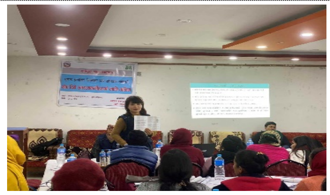
Technical assistance in district microplanning workshop and 4 batches of vaccinators training on MR and TCV SIA