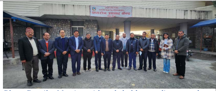
Photo Details: Meeting with stakeholders to discuss and recommend the strategic action point for Active Case Finding of TB cases