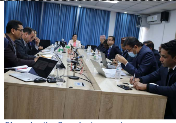
Photo details: Consultation meeting on provincial public health act