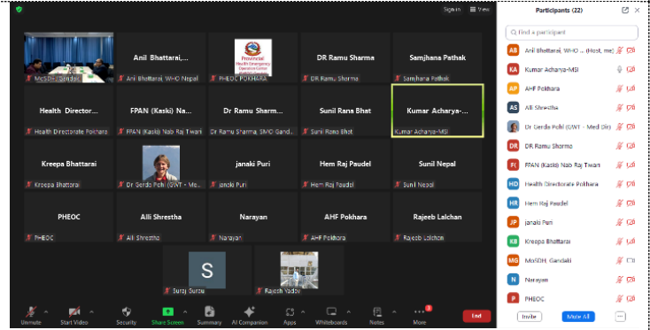
Photo Details: PHO facilitating Health Development Partner's Meeting