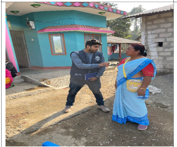
Oriented FCHV about Kala-azar during case-based surveillance