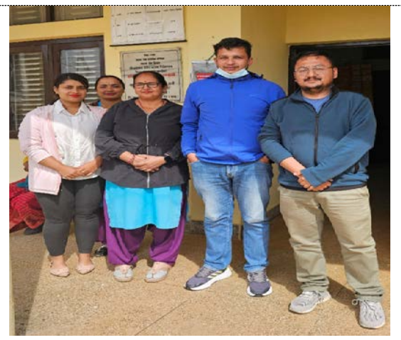
Monitoring and supervision of NCD and MH programs at Lamjung district