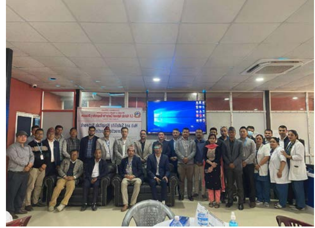
Group photo of Hub and Satellite Hospitals network interaction meeting