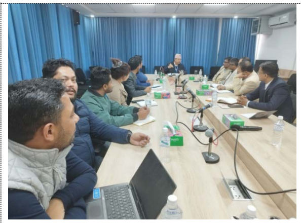
Photo Details: WHO Courtesy meeting with MoSDH Secretary and other officials and WHO Team