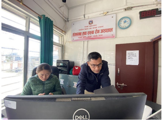
Orientation to the staffs of ICDH on upgraded EMR